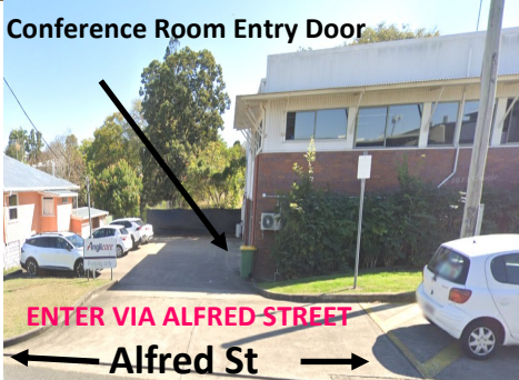
Conference Room Entry Door

Please speak with your ministry leader if you have any questions.