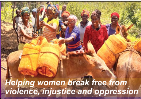
Helping women break free from violence, injustice and oppression

Please put your donation in an envelope marked "Lent appeal" and place in the offering bowl.